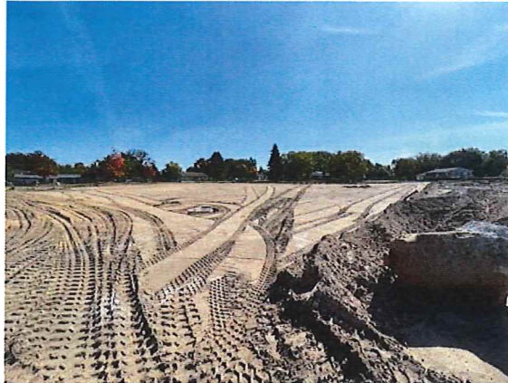
HS Student Parking Prep