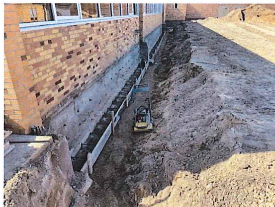
HS office Footing Tie In