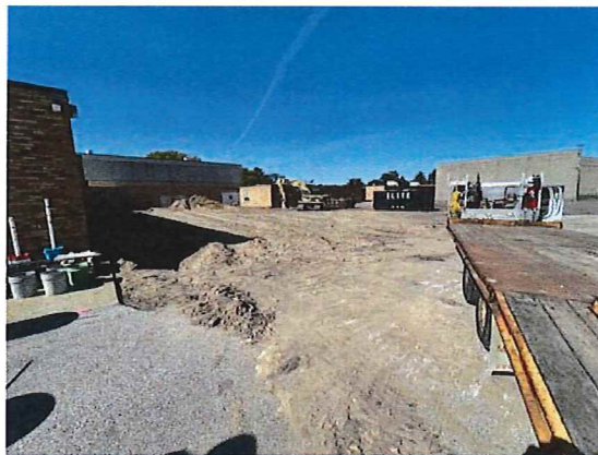
HS Office and Classroom Site